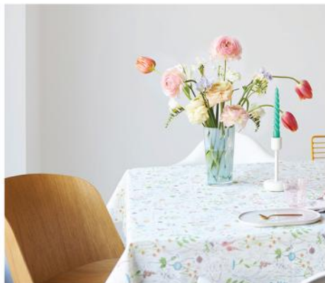
Table for One

Whether you have a sweetie or are happily single, give solo dining a try. While you needn't eat every meal alone—socialization is important to your overall health—dining by yourself can be a fun and enlightening adventure.